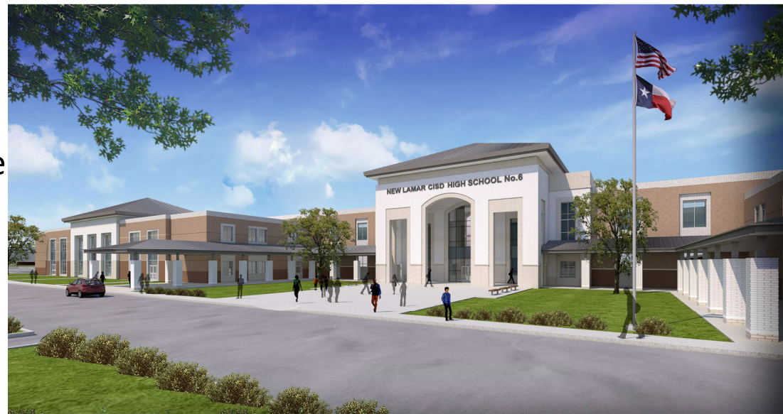
3D ENTRANCE PERSPECTIVE NEW LAMAR CONSOLIDATED HIGH SCHOOL 6 - OPTION 1

LAMAR CISD PBK A PROUD TRADITION | A BRIGHT FUTURE